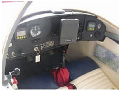
Flight, Engine, and nav instruments are digital but airspeed and turn coordinator remain the reliable "steamgauge" sort.