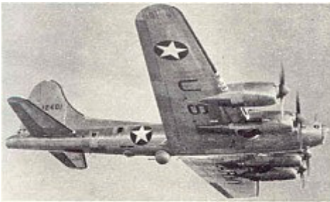
The Boeing XB-38, a B-17E fitted with liquid-cooled Allison engines in place of the regular Wright "Cyclones." This was the only one built for the Allison's were needed on the Lockheed P-38 and other planes. Experimentation with this plane was prematurely ended when it caught fire and burned.