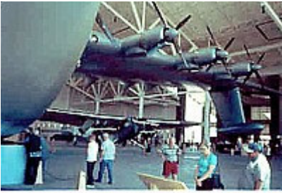
The "Spruce Goose" up close