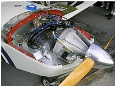
A VW engine turning- and going (flywheel first!)-- the "right" way thanks to the GPAS adapter nose. Sleeker cowl, too!